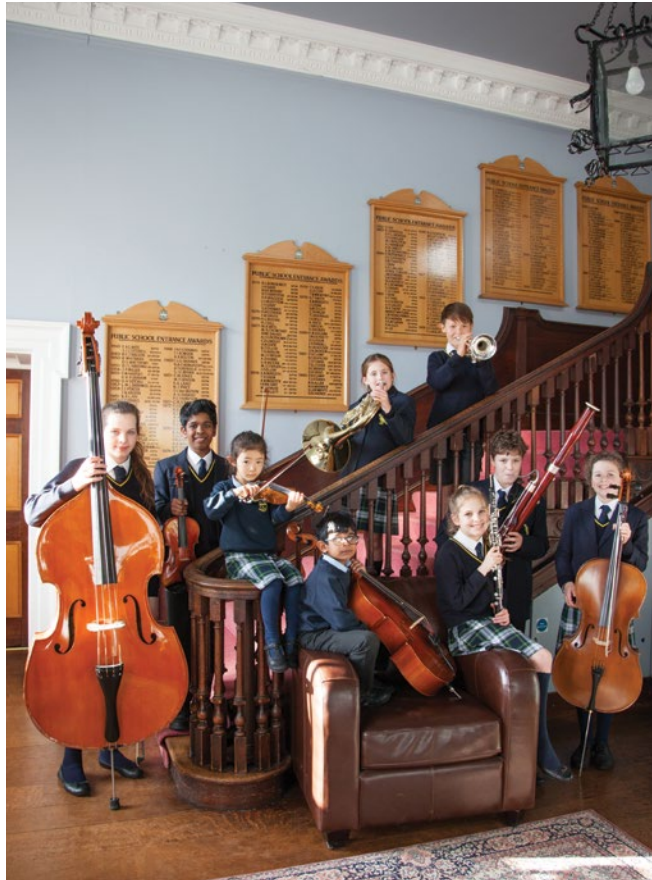
Music plays an integral part of life at Foremarke Hall. From Nursery through to Year 8 all pupils are given the opportunity to participate in a wide variety of classroom and extra-curricular music activities.