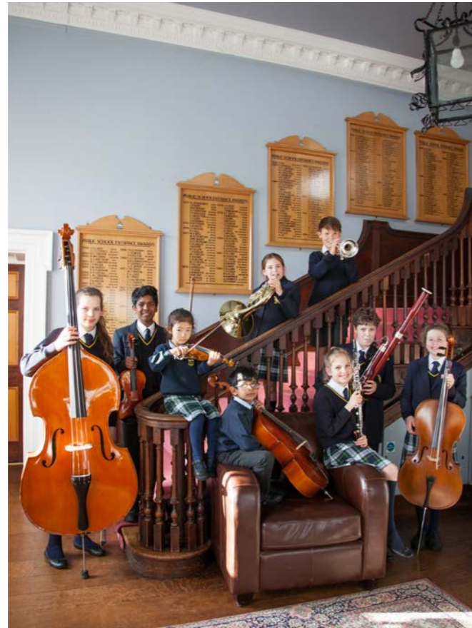
Music plays an integral part of life at Foremarke Hall. From Nursery through to Year 8 all pupils are given the opportunity to participate in a wide variety of classroom and extra-curricular music activities.