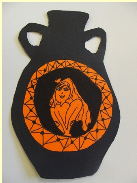
Samuel Savage 3M