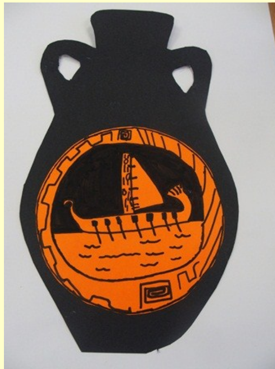
Jonathan Brain 3C

After studying examples of Ancient Greek pottery, Year 3s have spent several weeks carefully drawing their own replicas.