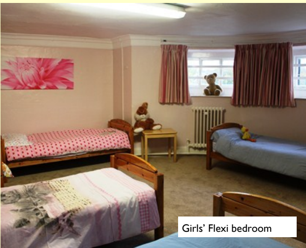
Girls' Flexi bedroom