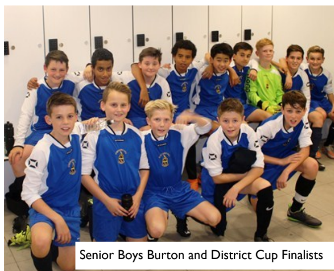
Senior Boys Burton and District Cup Finalists