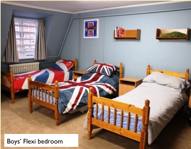
Boys' Flexi bedroom

Mrs Waldock is keen to remind parents that Flexi is available for late returns from fixtures and to take the stress out of winter travelling.