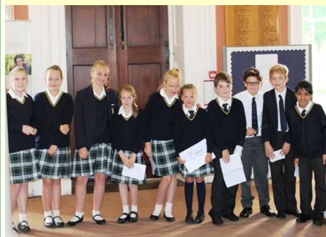
Pictured above are the candidates preparing to make their pitch.