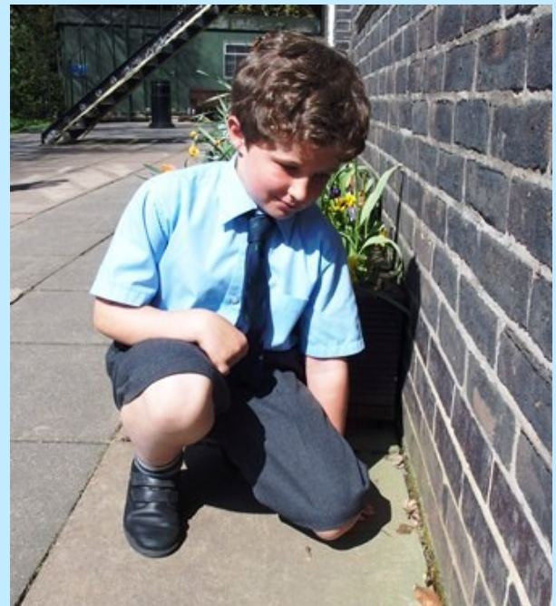
Can life really exist here?

Year 4 had the opportunity to visit the school wood last week during their Science lesson to investigate signs of life to be found in the four different layers of the forest habitats. There were some surprises but evidence of life and death were found.