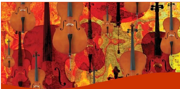
Repton School Concert series 2014-15

Quantity Beef burger & Chips Hot Dog & Chips Veg burger & Chips