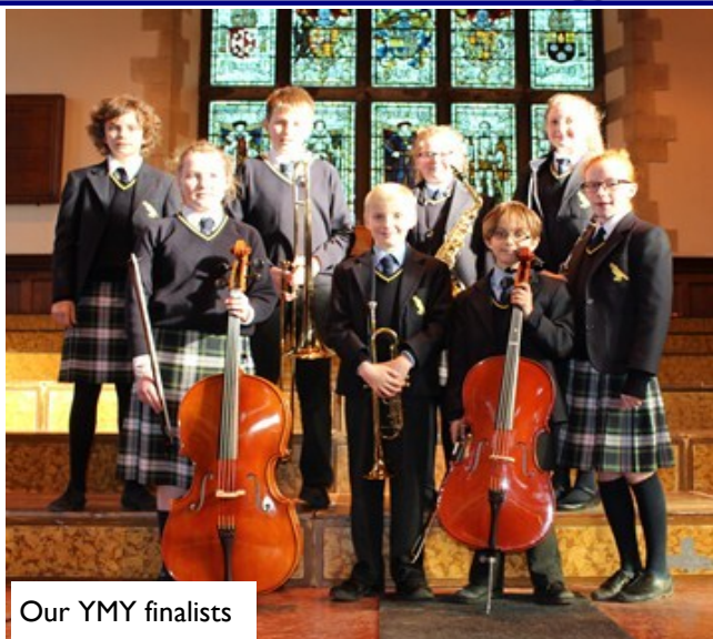
Our YMY finalists

The House Song Competition once again demonstrated the collective spirit of the Houses and the School. The sheer enjoyment, engagement and talent on show was a joy to behold. Well done to all the pupils.