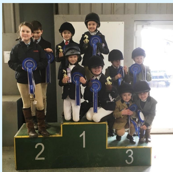
Congratulations to the Equestrian Team

Within my presentation I spoke of the potential of future landings currently being led by the Indians, Japanese and NASA. It is also the year Virgin Galactic may finally start sending paying customers into space. What will the next 50 years bring for our children; what firsts will they experience? All can be viewed with great excitement and opportunity and it wouldn't surprise me if a Foremarkian or two were not involved in pioneering something truly special.