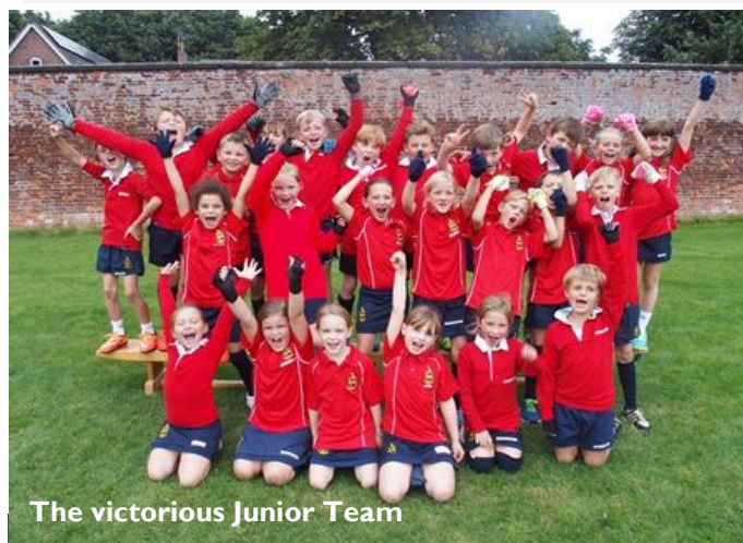
The victorious Junior Team