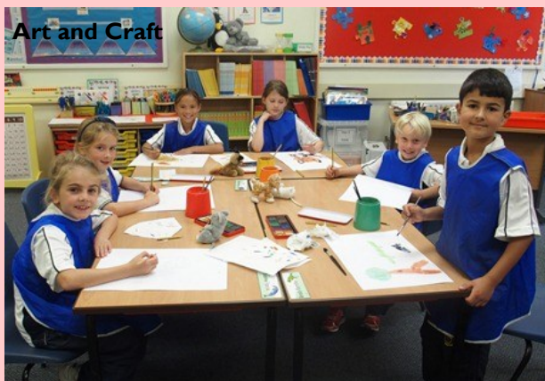
Art and Craft